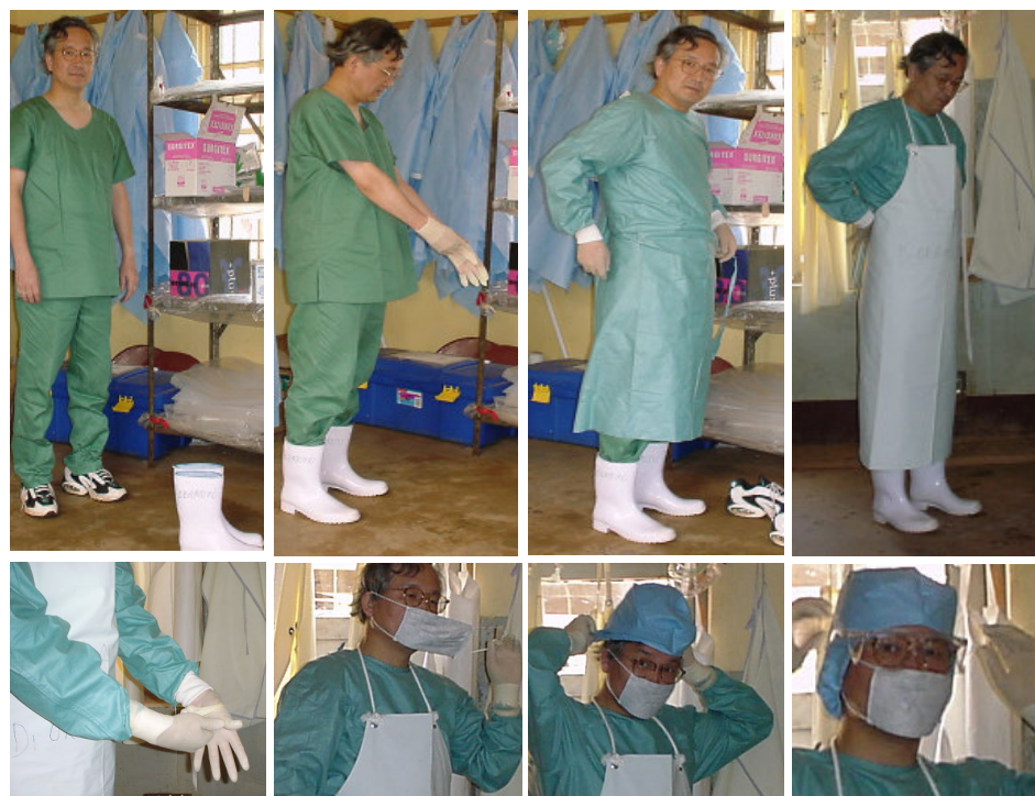
Figure 2 Placement of PPE, including surgical mask and goggles